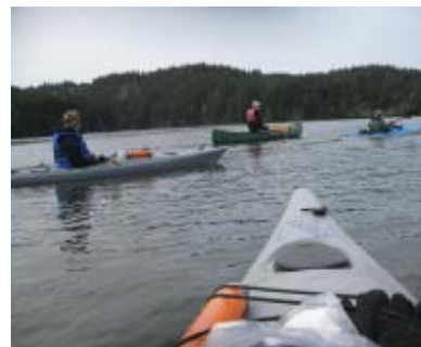
The Group Returning Home

bald eagles, peregrine falcons, ducks, geese, gulls, common murrens and cormorants (just a few of the 150 species that can be seen here in early spring)—we traveled a couple of miles up the slough to stop for our lunch on Younker Point.