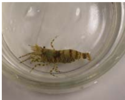
Broken back shrimp

In the coming months, a professional exhibit designer and fabricator will be recruited as the design moves from a conceptual phase to a specific layout and finally to construction and installation. The