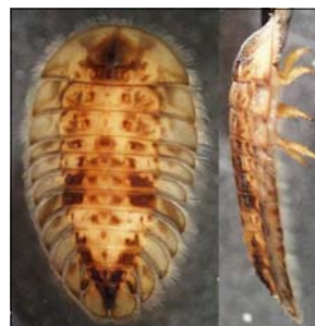
Psephenidae (water penny, larvae )