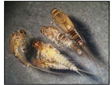
Baetidae (small minnow mayfly)