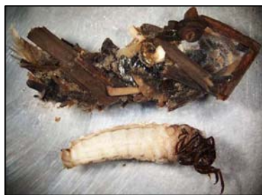
Limnephilidae (Northern caddisfly)