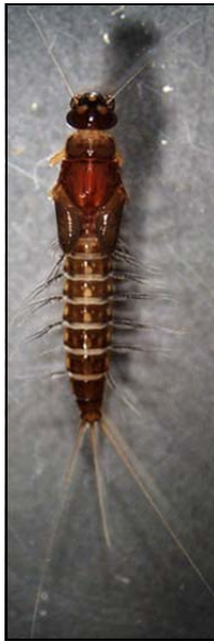
Leptophlebiidae (prong gill mayfly)