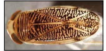
Corixidae (water boatman, adult)