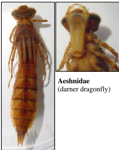
Aeshnidae (darner dragonfly)