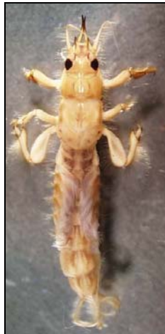
Ephemeridae (common burrower mayfly)