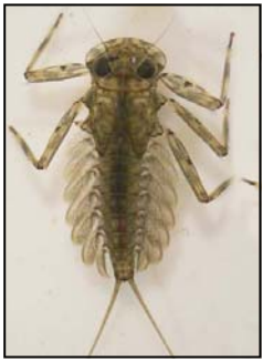
Heptageniidae (flathead mayfly)

Larvae (nymphs): elongated body, may be cylindrical or flattened, 3-20 mm (0.1-0.8 in.); tip of abdomen with three (sometimes two) long slender cerci (“tails”); developing forewing pads visible; plate-like, feathery, or fringed gills at sides of abdomen; some types have larger fore-gills that form a shield like cover over other gills; conspicuous eyes; slender antennae