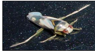
Notonectidae (backswimmer, adult)