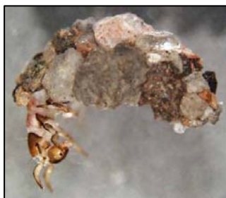
Glossosomatidae (saddle case-maker)

Larvae: elongate, caterpillar-like body; antennae reduced & inconspicuous; no wing pads; tip of abdomen has pair of short, clawed, anal prolegs, but no “tails” (cerci); 2-40 mm (0.08-1.6 in.); filamentous gills may be present in some types; some are free-living & spin silken nets, others build elongated, cylindrical, coiled, or saddle-shaped portable cases from stones, twigs, leaves, & other organic material; cases may persist in dry channels