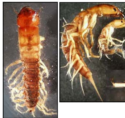
Order Megaloptera, Family Corydalidae (dobsonfly/fishfly larva, left) & Family Sialidae (alderfly larvae, right)