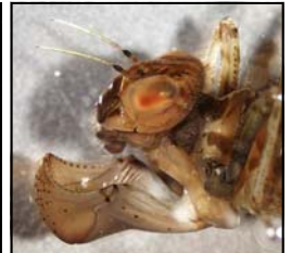
Libellulidae (skimmer dragonfly)