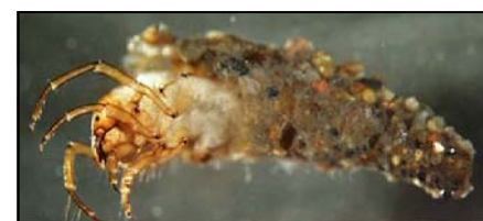
Leptoceridae (longhorned case-maker)