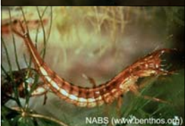
Dytiscidae (predaceous diving beetle, adult (top) & larva )