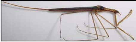
Nepidae (water scorpion, adult)