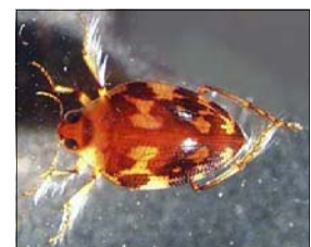
Haliplidae (crawling water Beetle, adult )