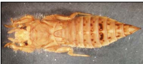
Gomphidae (clubtail dragonfly)

Larvae (nymphs): dragonflies = stout, cylindrical to flattened body; abdomen ends in 3 short stiff points; damsel flies = slender elongated body with 3 flattened leaf-like gills at tip of abdomen; both have large eyes, wing pads, long extendable “lower lip” (labium) that masks the lower part of head when not in use