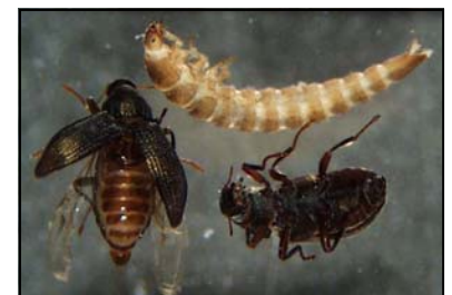
Elmidae (riffle beetle, larva and adults )