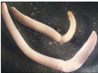
Class Oligochaeta (aquatic earthworm)