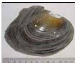
Anodonta nuttalliana (winged floater)