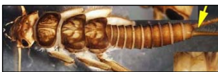
Perlidae (golden stonefly)