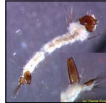
Culicidae (mosquito, larva)