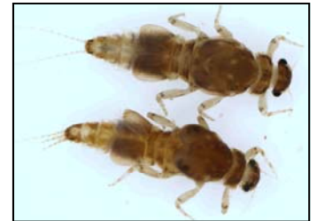
Caenidae (little squaregill mayfly)