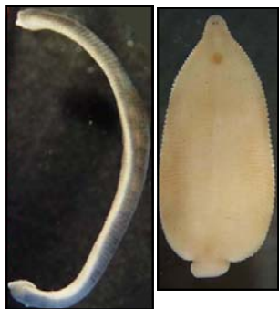
Subclass Hirudinea (leeches)