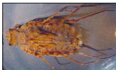
Macromiidae (river skimmer dragonfly)