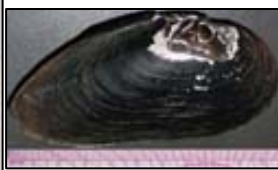
Margaritifera falcata (western pearlshell)