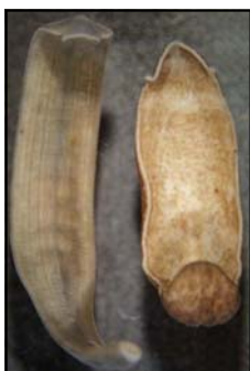
Class Turbellaria (flatworms)