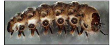
Blepharicidae (netwinged midge, larva)