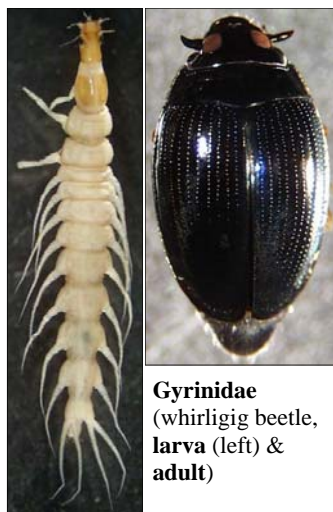
Gyrinidae (whirligig beetle, larva (left) & adult )