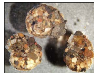
Helicopsychidae (snail case-maker)