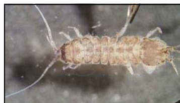
Order Isopoda (aquatic sowbug)