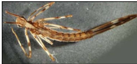
Calopterygidae (broadwinged damselfly)