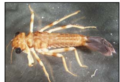
Coenagrionidae (narrowwinged damselfly)