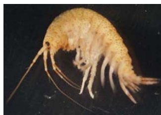
Order Amphipoda (scud, side swimmer)