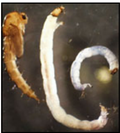
Chironomidae (non-biting midge, pupa & larvae)