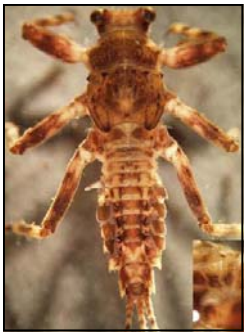
Ephemerellidae (spiny crawler mayfly)