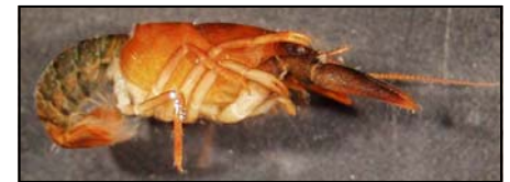
Order Decapoda (crayfish)