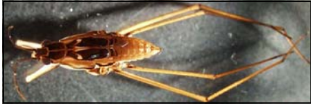
Gerridae (water strider, nymph)

Larvae (nymphs) & adults : body slender, oval to elongate, may be flattened; 1-65 mm (0.04-2.6 in.); cone- or needle-like beak arises from front of head, folded under body when not in use; have developing wing pads (nymphs) or wings (adults); adult forewings thickened & leathery at the base, membranous at the tips, cross at tips when folded; legs may be flattened like oars or fringed with swimming hairs