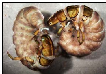
Philopotamidae (finger-net caddisfly)