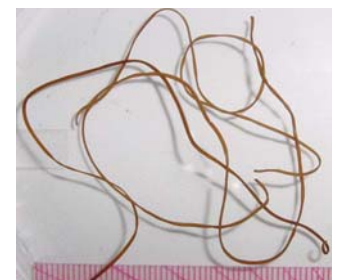
Phylum Nematomorpha (horsehair worm)