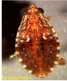
Belostomatidae (giant water bug, nymph)