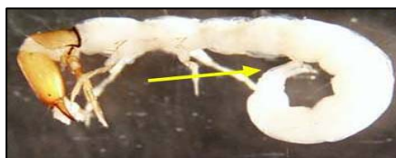
Hydropsychidae (net-spinning caddisfly)