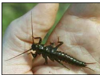
Pteronarcyidae (giant stonefly)

Larvae (nymphs): elongate, slightly flattened body with “roachlike” appearance; 5-35 mm (0.2-1.4 in.); long slender antennae; two pairs of wing pads visible on older larvae; tip of abdomen has two “tails” (cerci); fingerlike or filamentous gills may be visible on bases of the legs, thorax, or underside of abdomen