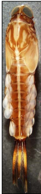
Isonychiidae (brush-legged mayfly)