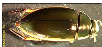
Hydrophilidae (water scavenger beetle, adult )